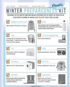
Winter Preparedness Kit