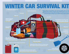
Winter Car Survival Kit